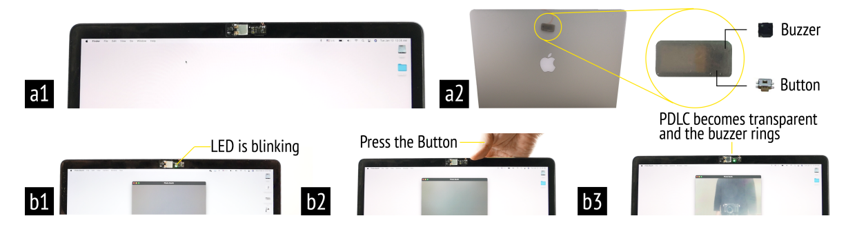
Fig. 5. This figure shows how HSWC works: (a1) HSWC is attached same as PDLC-SWC; (a2) The button and buzzer are contained in a container and are attached on the laptop lid; (b1) Even if a webcam is activated, the PDLC film stays opaque and the LED indicator is blinking, which indicates that the cover is closed; (b2,b3) A user needs to press the button manually to unblock the webcam.

of attack enabled by SWC: adversaries who can control the webcam LED indicator could, in turn, control SWC. For example, by switching on the LED indicator, an adversary could open the cover without the user's consent even if the user knows that the adversary is doing so. We call this new threat the "remote control" adversary.